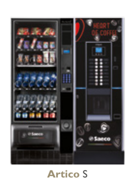
+ Cristallo Evo 400